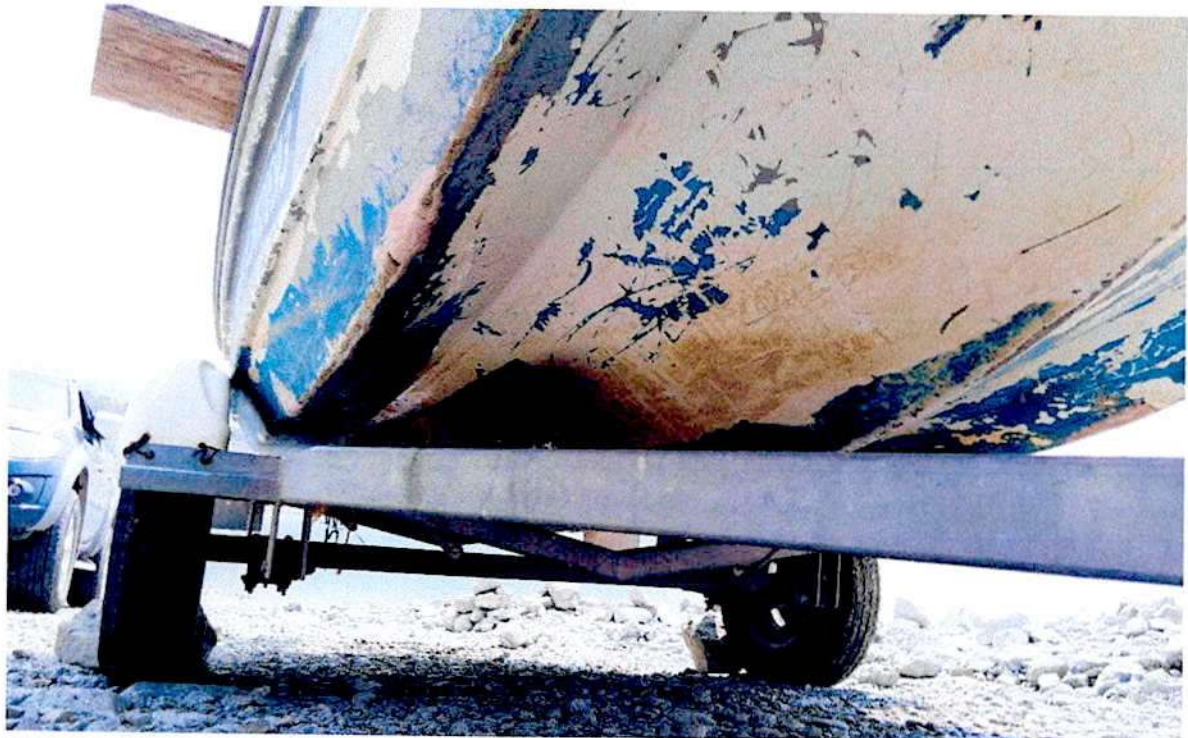
Front Bottom View